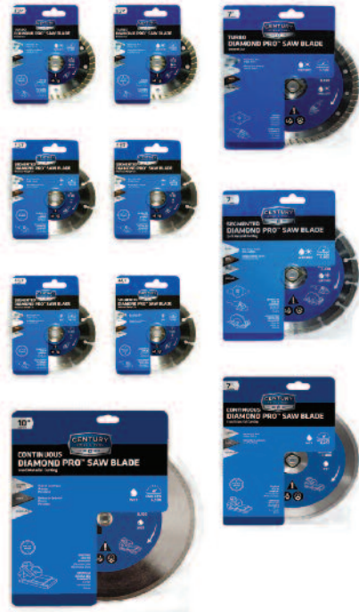
10 PIECE DIAMOND PRO™ SAW BLADE DISPLAY PART NO. 75460

SIZE: Height: 38" Width: 24" Projection: 6"