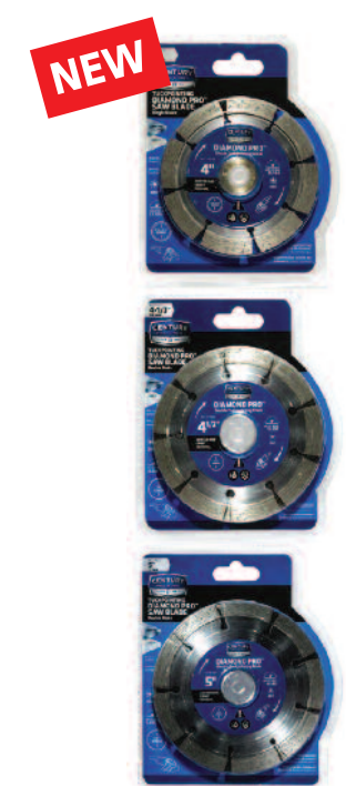
3 PIECE TUCKPOINTING DIAMOND PRO™ SAW BLADE DISPLAY PART NO. 75469

SIZE: Height: 20" Width: 6" Projection: 6"