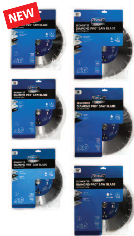
6 PIECE LRG. SEGMENTED DIAMOND PRO™ SAW BLADE DISPLAY PART NO. 75467

SIZE: Height: 56" Width: 28" Projection: 6"