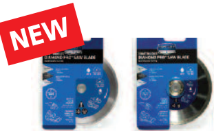
4 PIECE CONTINUOUS DIAMOND PRO™ SAW BLADE DISPLAY PART NO. 75471