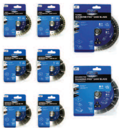
8 PIECE DIAMOND PRO™ SAW BLADE DISPLAY PART NO. 75461

SIZE: Height: 24" Width: 24" Projection: 6"