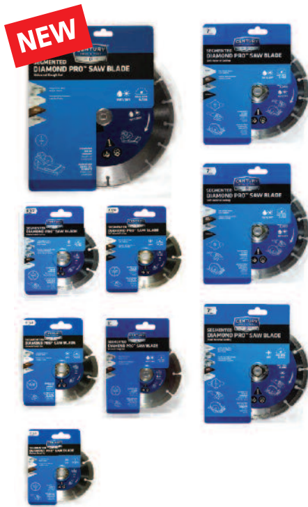
9 PIECE SEGMENTED DIAMOND PRO™ SAW BLADE DISPLAY PART NO. 75465

SIZE: Height: 36" Width: 22" Projection: 6"