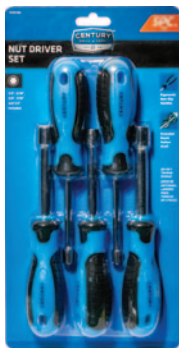
5 piece set includes: 1/4", 5/16", 3/8", 7/16" and 1/2" nut drivers.

1/4" Nut Driver Part #72140 Inner Pack: 3